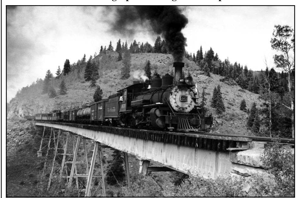
RMRRC Cumbres & Toltec Scenic Railroad photo freight special crossing Cascade Creek Trestle with mudhen #463 leading on July 25, 1998.