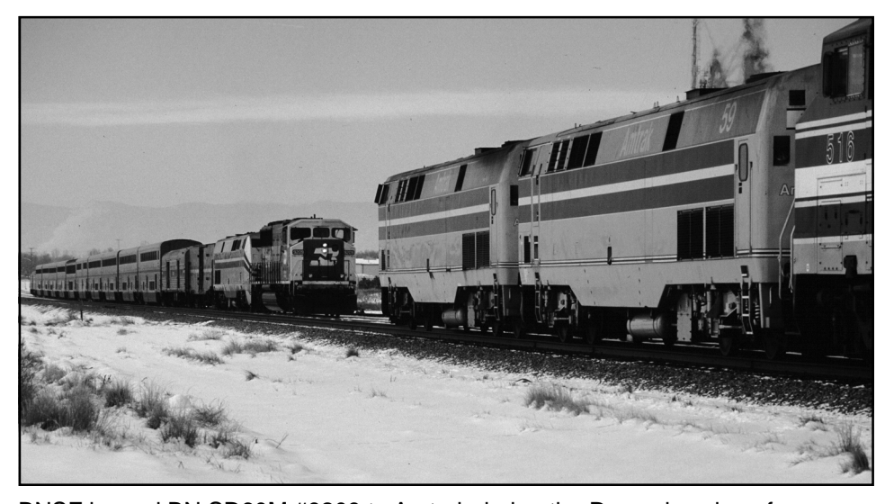
BNSF loaned BN SD60M #9209 to Amtrak during the December deep freeze that hit the west in December 1998. Amtrak's California Zephyr's train 5 (at right) meet 12-hour late #6 at Irondale Siding, east of Commerce City, CO, on Dec. 24, 1998.

The new acquisitions provide additional revenue spaces and protect equipment to allow for year round operation. Currently, the entire AOE fleet is taken out of service for a minimum of twelve weeks (ends in Feb. 1999) for annual maintenance. Future schedules call for 12 month operations and over 100,000 miles each year. This equates to over 1,600,000 fleet miles each year. The new cars will give AOE the ability to cycle the cars in and out of service to meet inspection, repair and upgrade demands and will offer passengers a greater variety