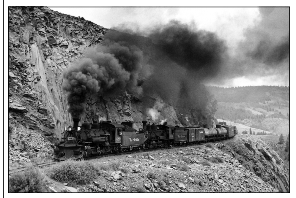
Engines #489 and #463 pulling RMRRC photo freight special at milepost 319.5 just west of Osier on July 26,1998.